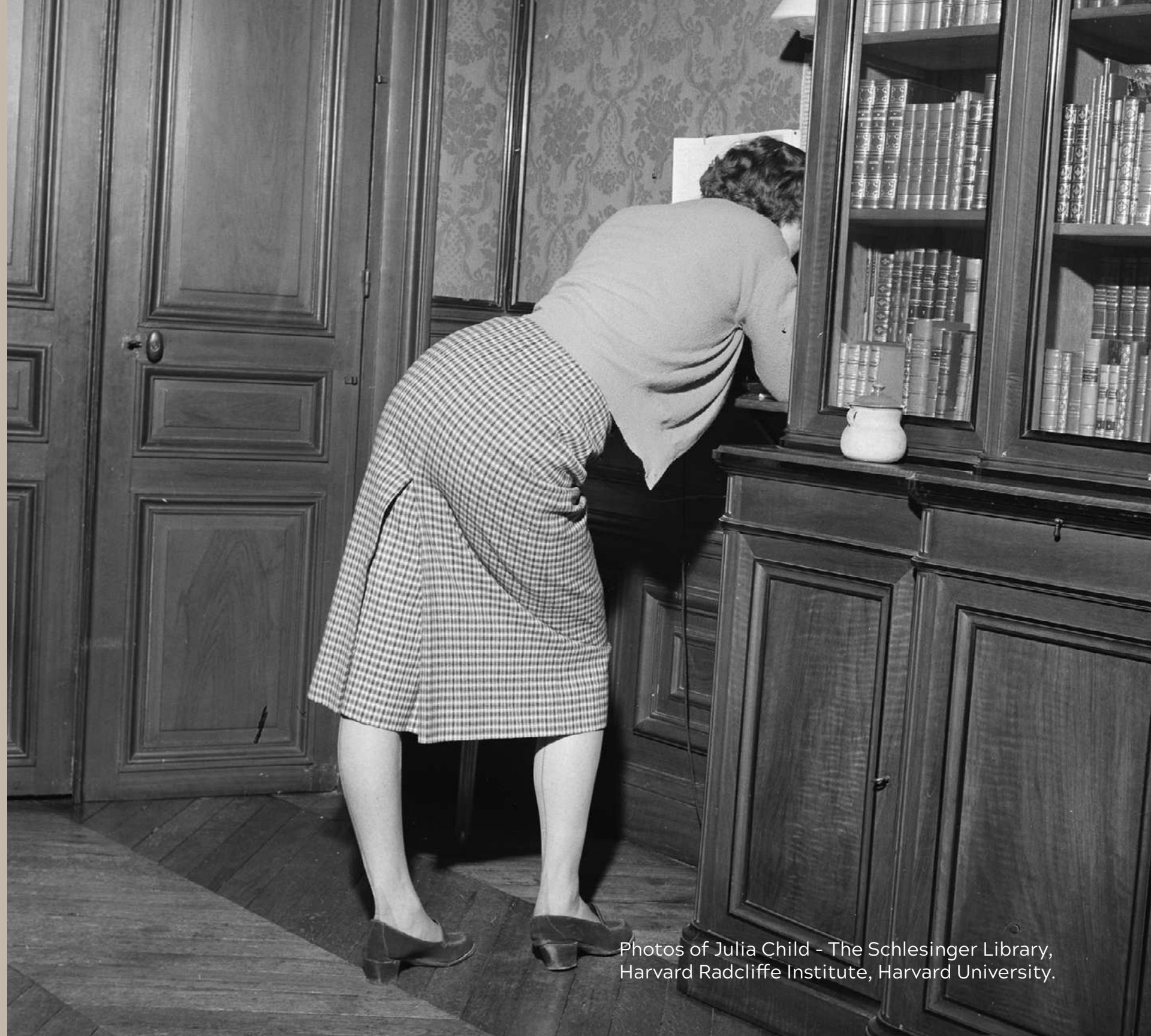
Photos of Julia Child

"Julia Child: A Recipe for Life" is produced and managed by Flying Fish, developed in collaboration with the Napa Valley Museum, under rights granted by The Julia Child Foundation for Gastronomy and the Culinary Arts and The Schlesinger Library, Harvard Radcliffe Institute, Harvard University, and generously supported by Oceania Cruises.